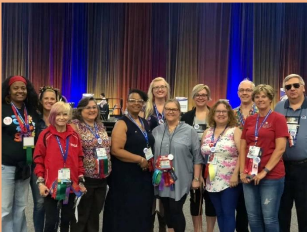
NEA-NBCTs standing in support of NBIs.